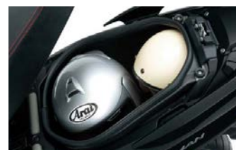
Underseat storage space

■ A slimmer, sharper and sexier design at both the front and rear ends compared to the previous model.