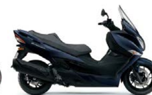
Metallic Mat Stellar Blue (YUA)

Specifications, appearance, colors (including body color), equipment, materials and other aspects of the "SUZUKI" products shown in this catalogue are subject to change by Suzuki at any time without notice, and they may vary depending on local conditions or requirements. Some models are not available in some regions. Each model may be discontinued without notice. Please inquire at your local dealer for details of any such changes.