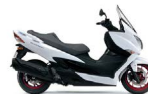
Pearl Glacier White (YWWW)