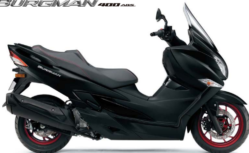
Metallic Mat Black No.2 (YKV)