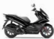
Pearl Nightstar Black