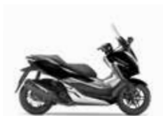
Pearl Nightstar Black