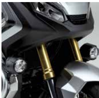
LED Fog Light Kit 08ESY-MKH-FLK17

Set of 2 additional LED headlights with all necessary components for fitment to the front side pipe. Increase the visibility for the riders and make him more noticeable for the traffic surrounding him. Front side pipe also included in this pack. € 858,00