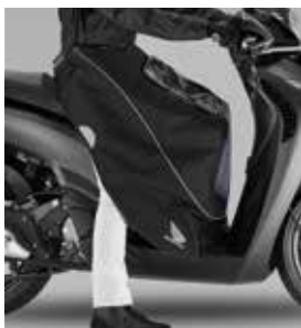
Scooter blanket 08T56-KTF-800/800A

Set of round-shaped 3-piece strips for easy Polycarbonate Windshield with knuckle visors included. Height: 46cm € 129,00