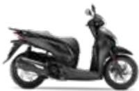
Mat Cynos Grey Metallic