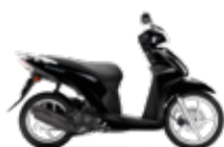
Pearl Nightstar Black