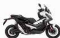
Mat Pearl Glare White