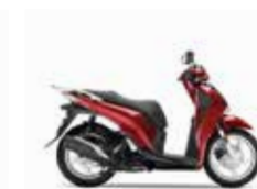
Pearl Splendor Red