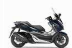
Crescent Blue Metallic