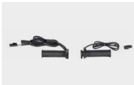
Grip Heaters Kit 08HGA-KTW-16HG

Black water-repellent fabric with zips. Insulated lining for extra warmth. Includes a chest cover for additional protection and a seat cover to keep the seat dry when parked. 2 sizes available: Standard (08T56-KTF-800) XL (08T56-KTF-800A) € 72,00