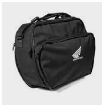
35L Top Box Inner Bag 08L09-M6S-D30

35L of carrying capacity. Can store 1 full-face helmet or 2 open-face helmets. Quick-locking and easily detachable. Top box pad and rear carrier included. Top box lid produced in matching colours for each models of SH300i available. € 650,00