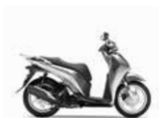
Lucent Silver Metallic