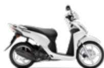
Pearl Cool White