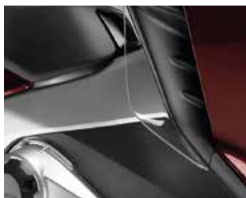
Leg deflector kit 08R70-MJL-D70

Connector needed to install the grip heaters € 36,00