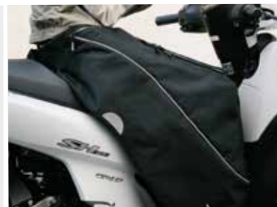
Scooter blanket 08T56-KTF-800 or 08T56-KTF-800A

Set of 2 injected polycarbonate knuckle visors that attach to the fairing and further improve wind protection. €29,00