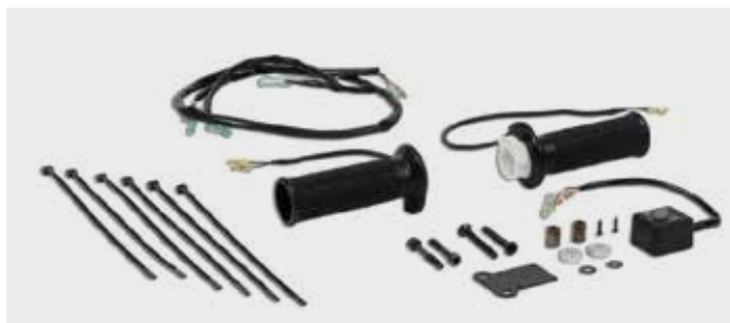
Grip Heaters Kit 08T70-K96-J00

Specially engineered for PCX 125, this windshield features a sporty look that complements the scooter's styling. Dimensions: 566x466x4mm. All components required to install the windshield are included. € 199,00