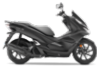
Mat Carbonium Gray Metallic