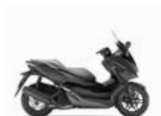
Mat Cynos Grey Metallic