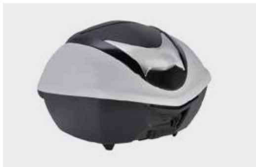
35L Smart Top Box Kit 08ESY-K53-TB192A, B, C, D, F or G

35L of carrying capacity. Can store 1 full-face helmet or 2 open-face helmets. Quick-locking and easily detachable. Top box pad and rear carrier included. Top box lid produced in matching colours for each models of SH300i available. € 650,00