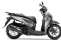
Mat Ruthenium Silver Metallic