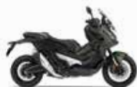
Mat Armored Green Metallic