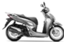
Lucent Silver Metallic