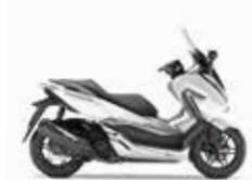
Mat Pearl Cool White