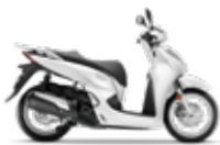
Pearl Cool white