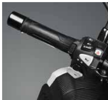
Heated Grips Kit 08ESY-MKH-HGA17

Silver Cowl Guard protects the motorcycle's fairing as well as providing a mount for the LED Fog Lights. € 295,00