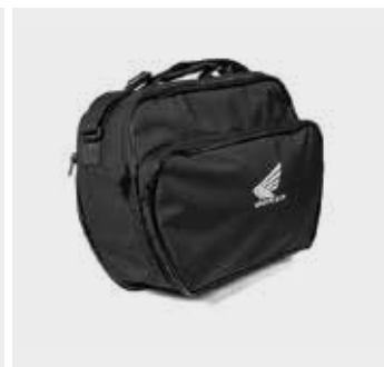
35L Top Box Inner Bag 08L09-MGS-D30

Complete kit allowing to operate the 35L Top Box with the scooter's key . € 30,00