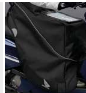
Scooter blanket 08T56-KRJ-800

The grip heater warms up the right and left grips of the handlebar for comfortable riding on a cold day. The grip heater switch is located on the right handlebar pipe. The attachment kit and the harness are included in the kit. € 299,00