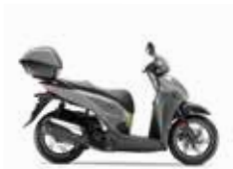
Air Force Gray / Titanium Green