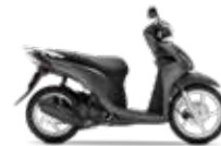
Mat Carbonium Grey Metallic