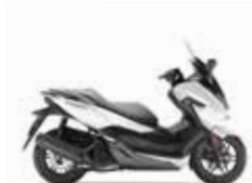
Mat Pearl Cool White