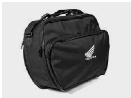
35L Top Box Inner Bag 08L09-M6S-D30

35L of carrying capacity. Can store 1 full-face helmet or 2 open-face helmets. Quick-locking and easily detachable. Top box pad included. Top box lid available in several colours to match all SH models available. € 219,00