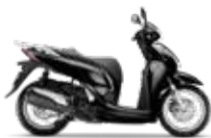
Pearl Nightstar Black