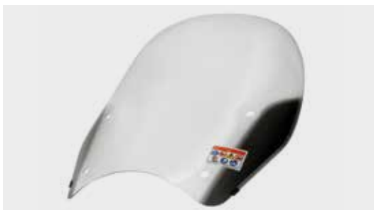
Wind Shield Kit 08R70-K44-D00

Windshield specially engineered for Vision. Improve the protection against the elements. Dimensions: 420x447x2mm. Knuckle visors set sold separately. € 238,00