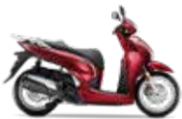
Pearl Splendor Red