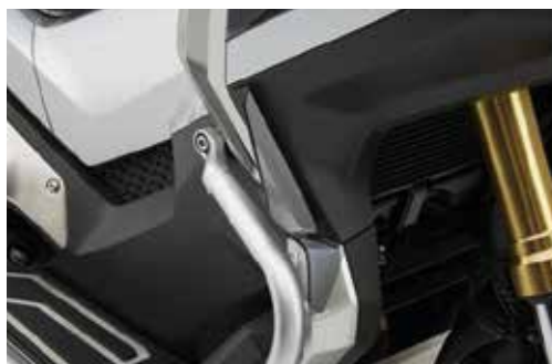
Foot Deflector Kit 08R72-MKH-D00

Channel the air flows around the X-Adv and improve the comfort of the riders during long journeys. € 132,00