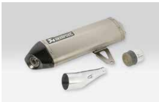
Akrapovic Slip-On Muffler (*) 08F88-MKA-900

Description: Titanium muffler with carbon fibre end cap. Non-removable noise reduction insert. Fitting kit included. Compliant with panniers and main stand. Performance: - Power: +0.6Kw at 4800 rpm | Torque: +1.2Nm at 2900 rpm | Weight: -1.0kg | EC/ECE approved | € 699,00