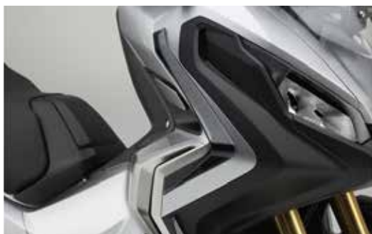
Deflector Pack 08ESY-MKH-DFL17

This specifically designed covers will keep you warm and dry without damaging the slick look of your X-ADV. • Neoprene outer covering • Synthetic fur thermal padding on the back of the hand • Rigid opening with elastic windproof adjuster • Compliant with Genuine X-ADV hand protectors € 59,00