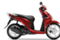
Pearl Splendor Red