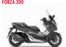
Mat Cynos Grey Metallic