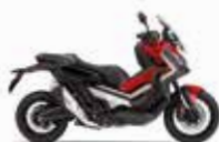
Grand Prix Red