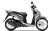
Moondust Silver Metallic