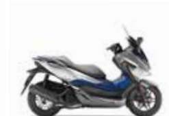
Mat Lucent Silver Metallic