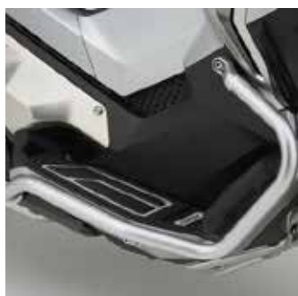
Front Side Pipe Kit 08P70-MKH-D00

Set of 2 additional LED headlights with all necessary components for fitment to the front side pipe. Increase the visibility for the riders and make him more noticeable for the traffic surrounding him. Front side pipe also included in this pack. € 858,00