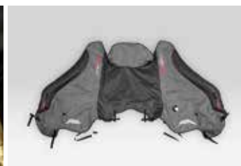
Leg cover* 08TUC-LEG-17

A set of two polyurethane Foot Deflectors that offer increased wind protection. € 52,00