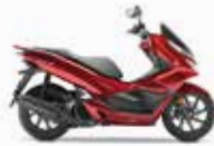
Pearl Splendor Red