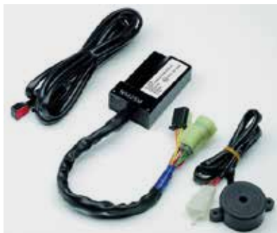
Honda Lock Alarm Kit 08E55-KZL-800

Includes alarm with tilt function, led and 95dba siren. € 112,00