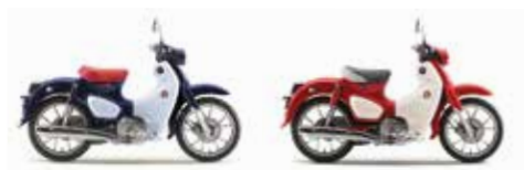
Pearl Niltava Blue