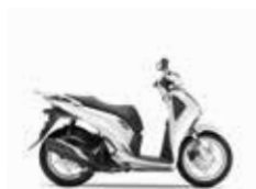
Pearl Cool White