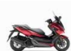
Mat Carnelian Red Metallic